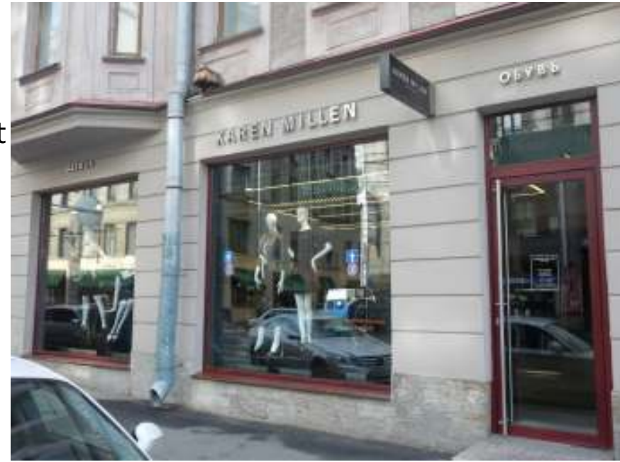
Karen Millen Flagship, St Petersburg