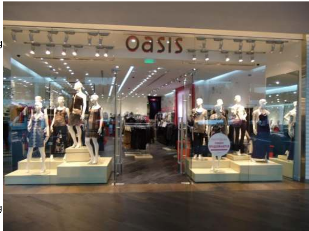
Oasis, Vegas Mall